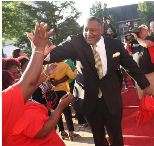
Pittsburgh Schools Superintendent Anthony Hamlet visits Pittsburgh Miller PreK-5 as part of the school's second annual First Day of School Red Carpet.

Beginning this fall, all drinking fixtures and fountains in the common area of all Portland Public Schools in Oregon will be in full operation. According to district officials, test results show that the quality of the water coming from the drinking faucets is now better than the Environmental Protection Agency recommendations for schools. The district is also embarking on a plan to reduce bottled water in schools.