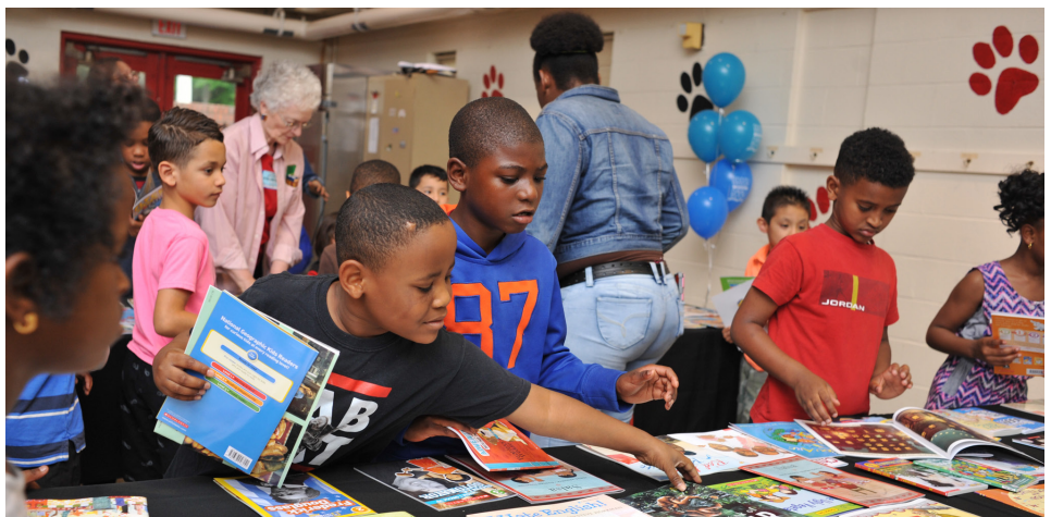
Students select books for summer reading in a new initiative launched by North Carolina's Guilford County Schools in Greensboro.