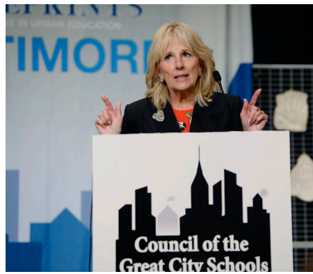
Education advocate Jill Biden

At the University of Delaware, Biden decided to become a teacher herself, and