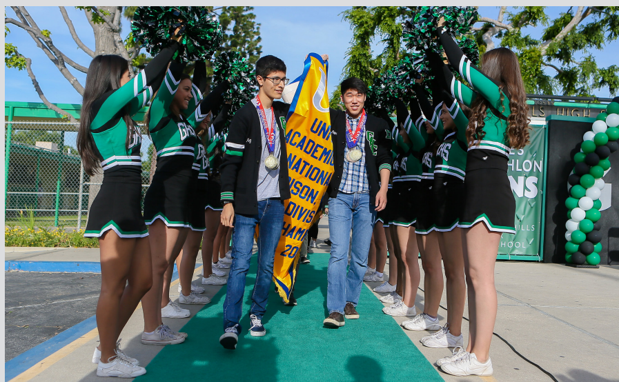
Students from the decathlon team at Granada Hills Charter School are welcomed home with a rally after winning the 2017 United States Academic Decathlon competition.

Teams compete in 10 categories: art, economics, essay, interview, language and literature, mathematics, music, science,