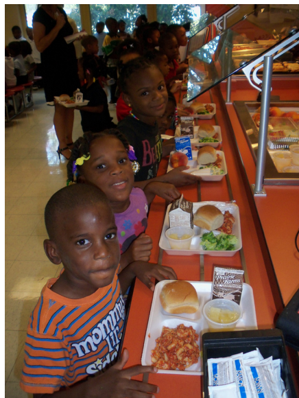
St. Louis students line up to receive a healthy meal.

Beginning in 2008, the St. Louis school system has worked to improve menus to provide healthier meals for its students. Local farmers within 100 miles of the city support the school system's effort by growing and harvesting fresh fruits and vegetables for delivery to the schools.