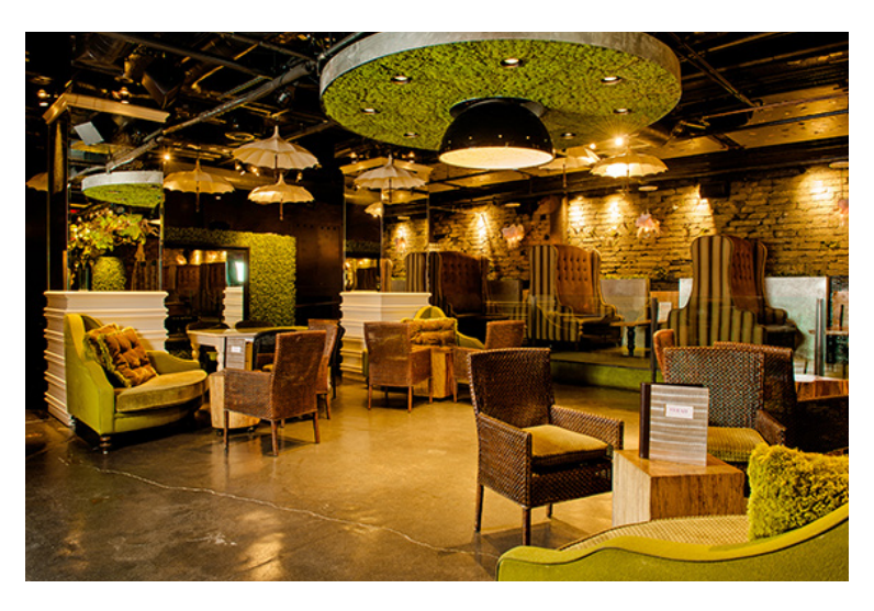
Vin de Syrah Saturday Night's Reception