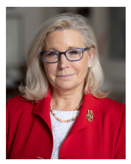
Liz Cheney U.S. Representative for Wyoming's At-Large Congressional District (2017 – 2023)