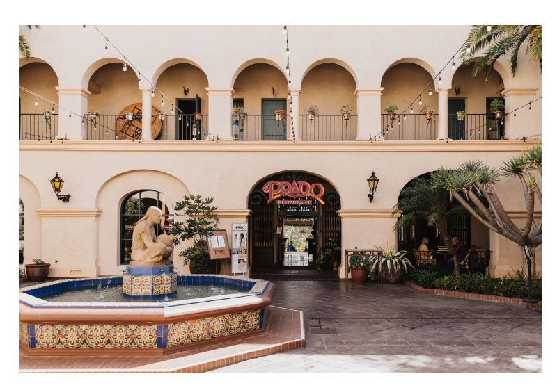
The Prado Wednesday's Welcome Reception