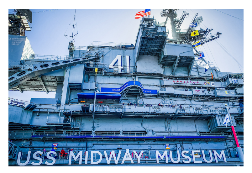
USS Midway Museum Friday Night's Reception