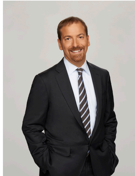
Chuck Todd Chief Political Analyst at NBC, Moderator of Meet the Press

8:00 am - 9:30 am 8:30 am - 12:00 pm 12:30 pm - 2:30 pm 6:00 pm - 8:00 pm