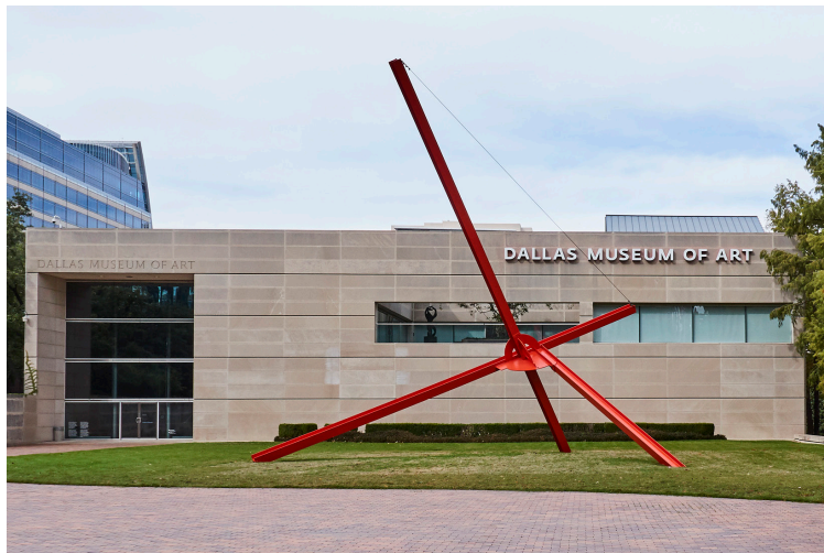
Dallas Museum of Art Wednesday's Welcome Reception