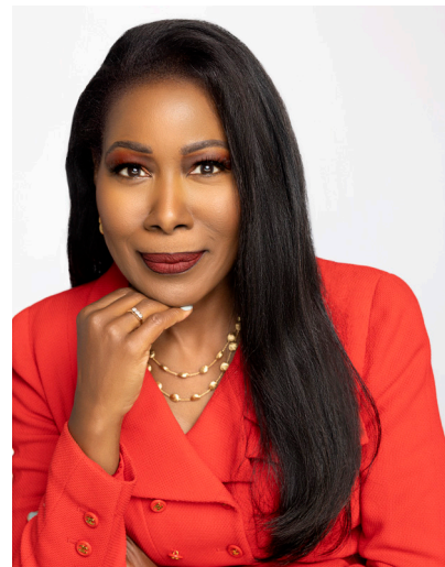
Isabel Wilkerson New York Times Best Selling Author and Pulitzer Prize Winner