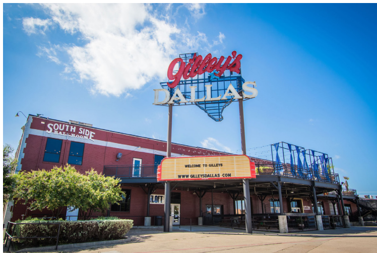
Gilley's Dallas Saturday Night's Reception