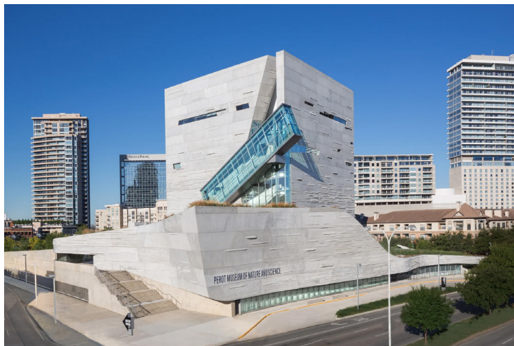
Perot Museum of Nature and Science Friday Night's Reception