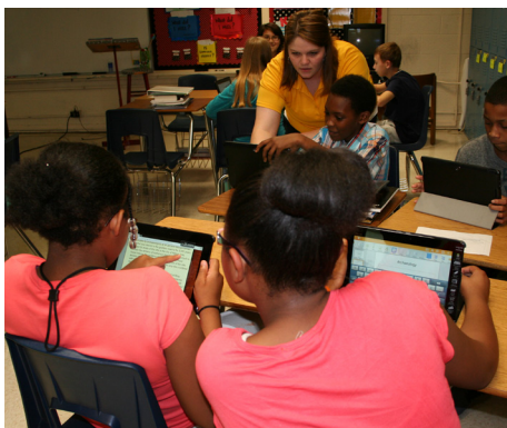
Students at Johnson Street Global Studies K-8 in Greensboro's Guilford County Schools work on their tablets as part of the district's PACE project.

Guilford County Schools in Greensboro, N.C., is using a $35.2-million Race to the Top grant to fund its Personalized Achievement, Curriculum and Environment (PACE) project. The initiative will provide computer tablets to more than 17,000 middle school students at 18 middle schools.