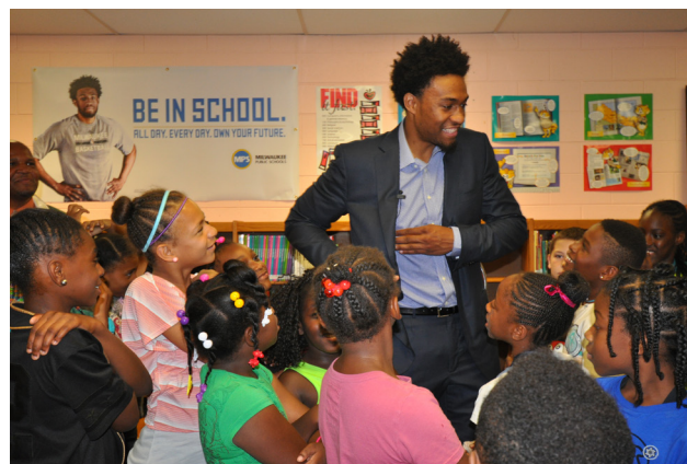
Milwaukee Bucks basketball player Jabari Parker talks with students at the launch of a new attendance initiative.

The Milwaukee Public Schools has teamed up with the Milwaukee Bucks pro-