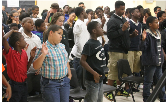
Students in Broward County Public Schools' PROMISE program in Florida take a pledge to better themselves.

In the 2011-2012 school year, more than 1,000 students in Broward County Public Schools in Fort Lauderdale, Fla., were ar-