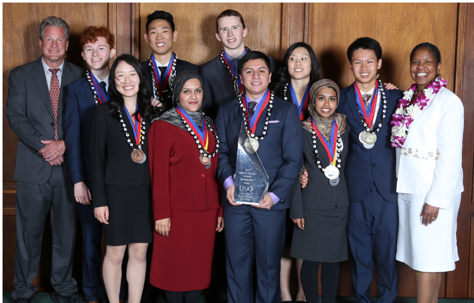
The El Camino Real Charter High School Academic Decathlon team from Los Angeles holds the winning trophy after being named the 2014 U.S. Academic Decathlon® champion.

The U.S. Academic Decathlon®, which is in its 33rd year, is a rigorous ten-event scholastic competition for teams of high school students.