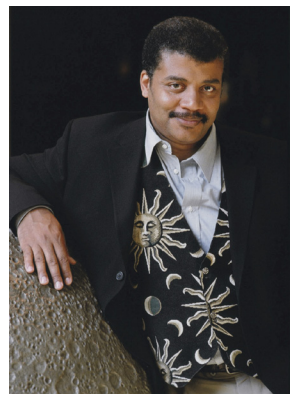
Neil deGrasse Tyson

Hosted by the Milwaukee Public Schools, the conference will also feature astrophysicist, author, and radio and television science commentator Neil deGrasse Tyson, who also serves as the Frederick P. Rose Director of the Hayden Planetarium at the American Museum of Natural History.