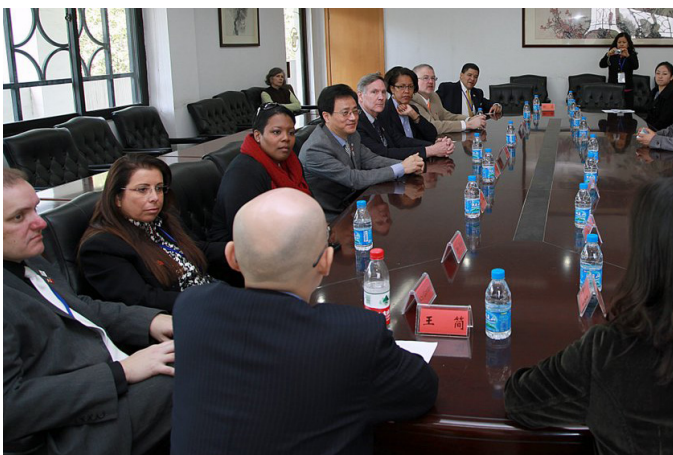
U.S. urban school delegation meets with officials from the Suzhou educational bureau.