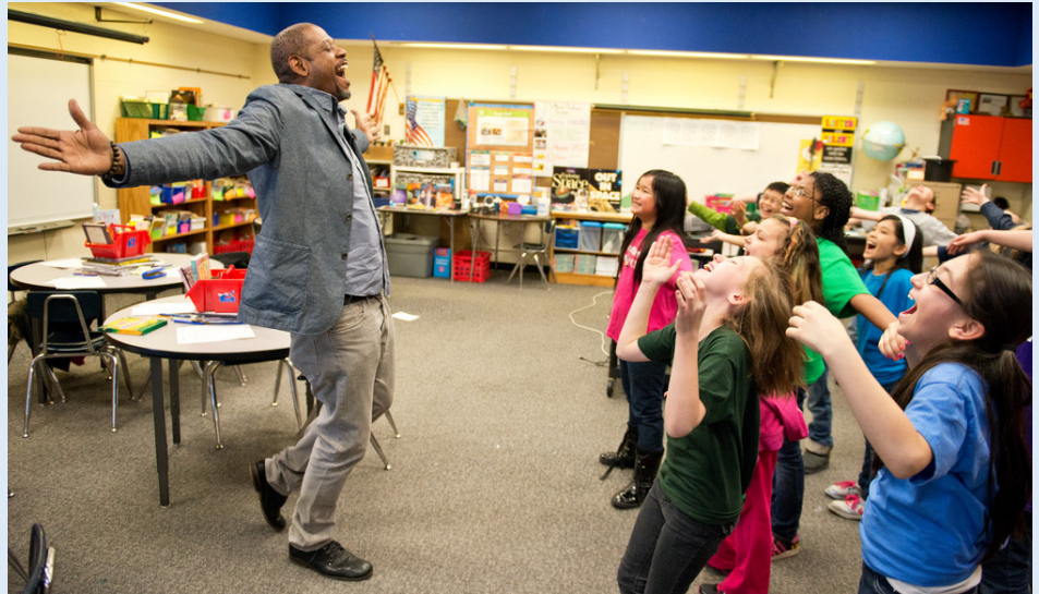
Actor Forest Whitaker works with students at Findley Elementary School in Des Moines, Iowa, as part of the school's participation in the Turnaround Arts program. Whitaker will be working with students at the school over the course of two years to support their educational reform effort.

Research has found that providing students with arts education leads to increased academic achievement and school engagement. As a result, many urban school districts are increasing their arts programming.