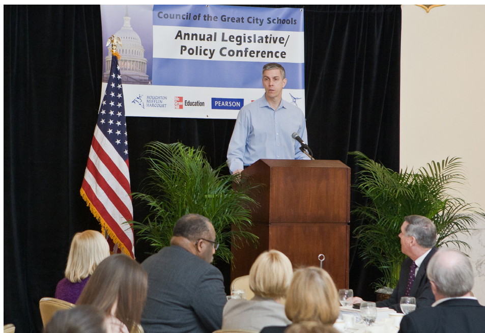
U.S. Secretary of Education Arne Duncan addresses big-city school leaders at the Council of the Great City Schools' recent Annual Legislative/Policy Conference.