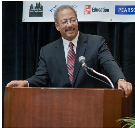
Congressman Chaka Fattah

He noted that 2,000 Americans have been killed since Sandy Hook due to gun