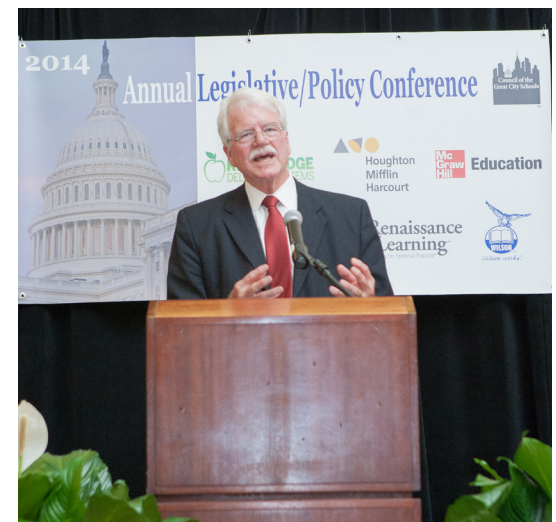
Congressman George Miller inspires conferees with his dedication to education equity.