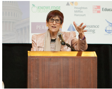
Congresswoman Rosa DeLauro

She said that if the nation wants to create jobs and grow the economy, the country’s educational system must provide opportunity for all, chiding members of both parties for not stepping up to the plate and doing right by education as a national priority.