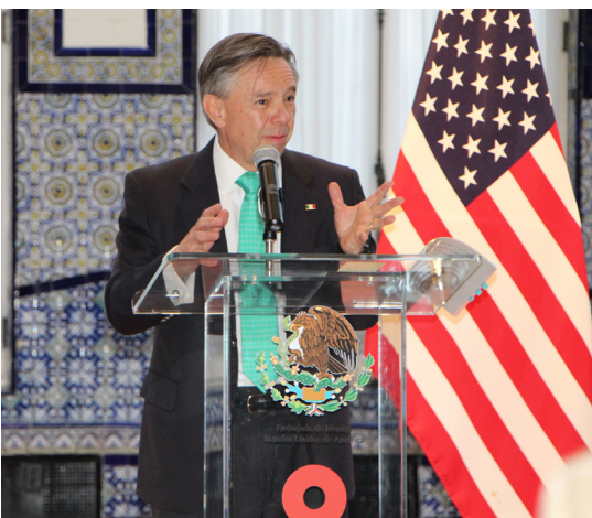
Ambassador Eduardo Medina Mora of Mexico addresses urban educators at the Mexican Cultural Institute, site of the Legislative Conference's welcome reception.