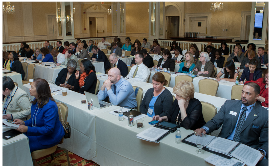
Urban school leaders listen intently at Legislative/Policy Conference session.