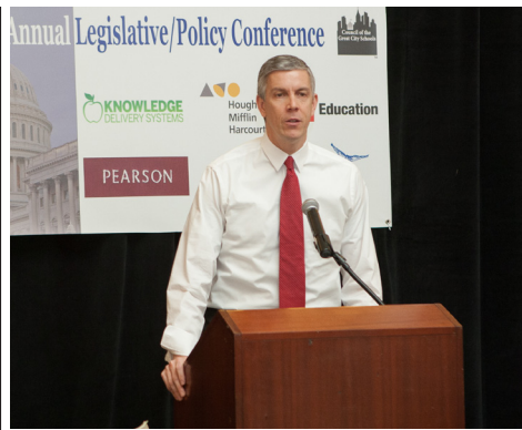
Education Secretary Arne Duncan

He said that his department is working to provide school districts with money for new technology, and is trying to make sure schools and students get access to high